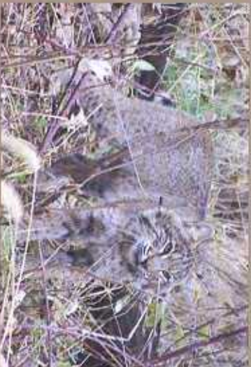
Adult female bobcat (No. 120)

Managing and restoring carnivore populations is one of the most challenging ecological and socio-logical problems facing wildlife biologists today. People often view predators as either positive indicators of healthy ecosystems or as pests that create conflicts with livestock and other wildlife.